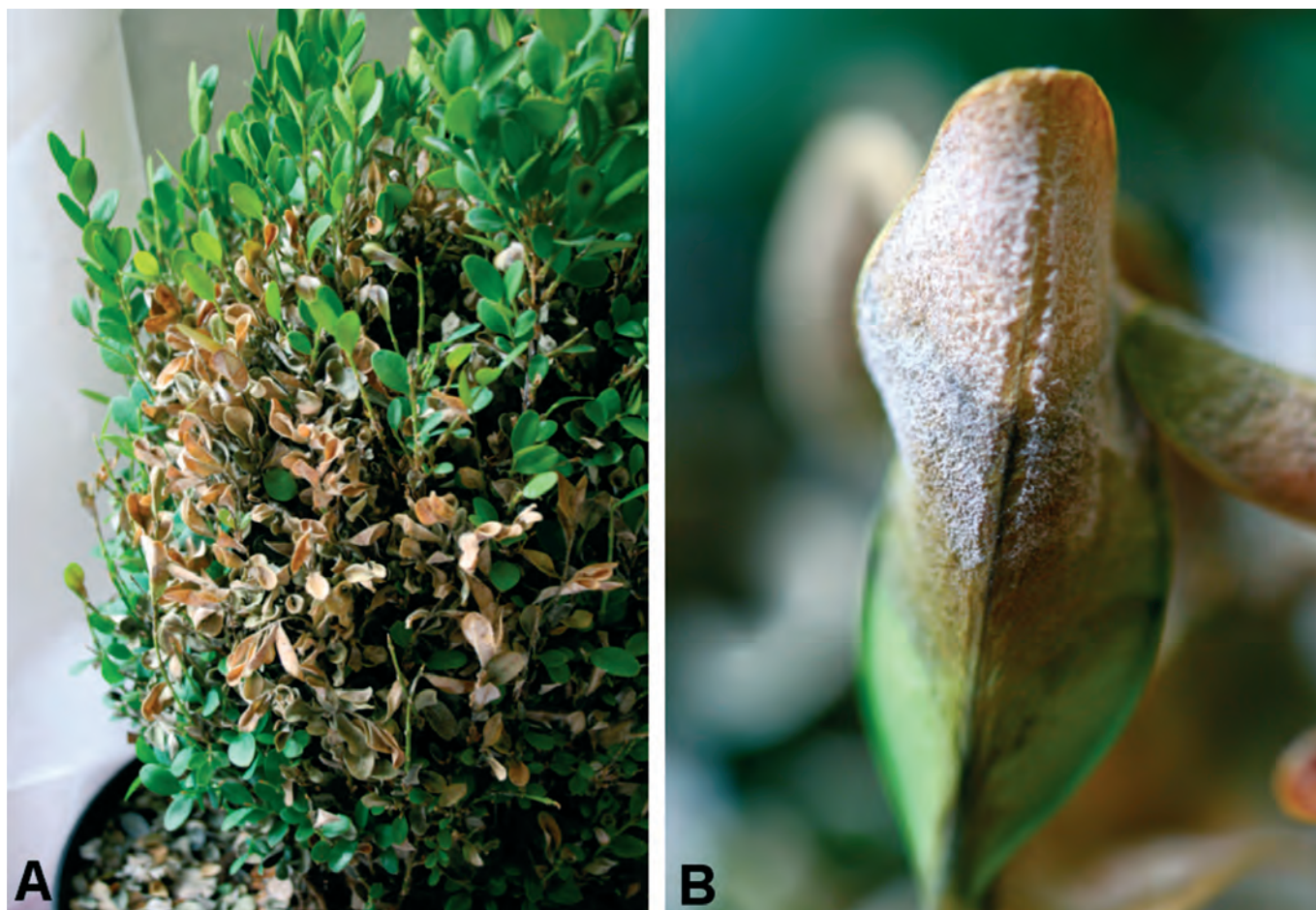
Fig. 1. A. Buxus sempervirens ‘Suffruticosa’ infected by C. buxicola showing an expanding area of curled blighted leaves and incipient defoliation. B. Close-up of an infected leaf. The area colonized by C. buxicola is light-brown with dark-green borders. Pathogen propagules cover the abaxial surface.

Results of these observations showed that the pathogen had cylindrical conidia, rounded at both ends, straight, hyaline, 1-septate, 42–68 \mu\text{m} [average 47.3; s.e. 0.8 ( N = 20 )] \times 4–6 \mu\text{m} [average 3.9; s.e. 0.1 ( N = 20 )] in size. Conidia were formed on conidiophores with penicillate arrangement of fertile branches, and were arranged in cylindrical clusters held together by colourless slime. The stipe of the conidiophores ended with an ellipsoid vesicle 7–11 \mu\text{m} [average 9.2; s.e. 0.4 ( N = 8 )] in diameter (Fig. 2).